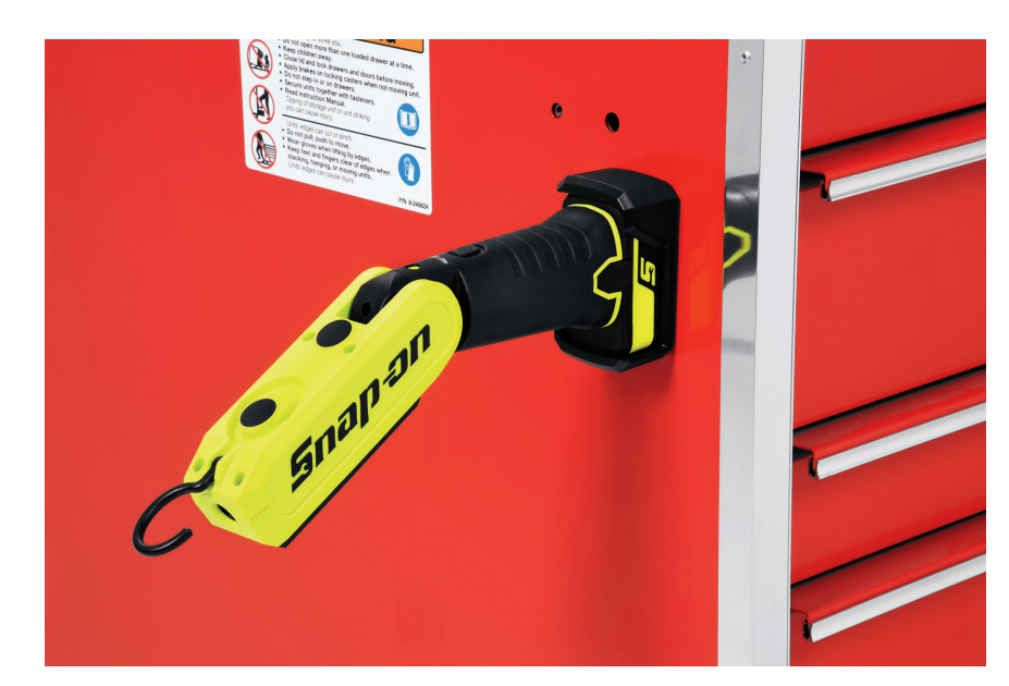
Light, battery, air ratchet and tool storage unit NOT included